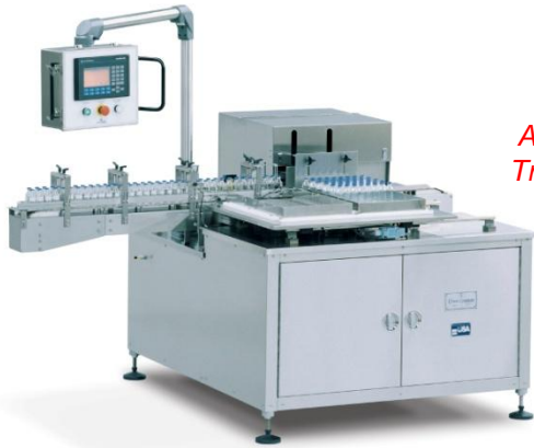
Automatic Tray Loader